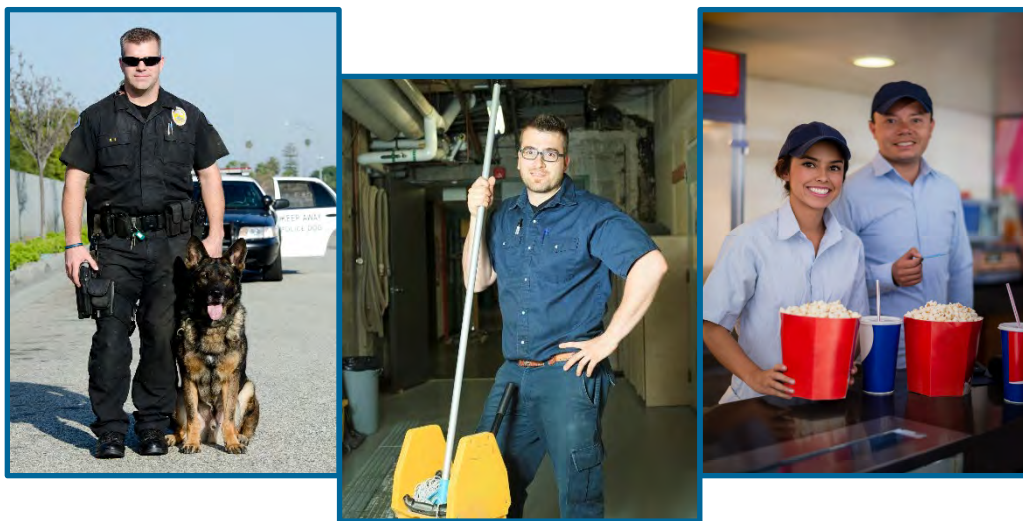
Figure 2: Sports league and venue stakeholders