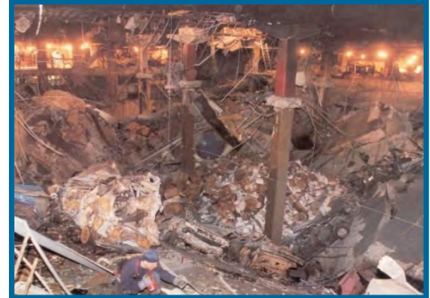
Figure 1: World Trade Center parking garage following the 1993 bombing that killed six people and injured 1,000.

Goal 7: Safely coordinate response activities at IED incident sites. These C-IED tasks include activities by which sports leagues and venues personnel can effectively and safely react at the IED incident site.