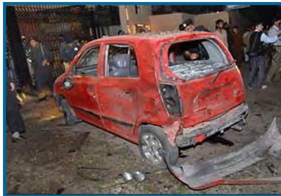
Figure 6: Stadium in Peshawar, Pakistan, following a November 2008 suicide bombing outside the stadium gates that killed three people and injured nine others.