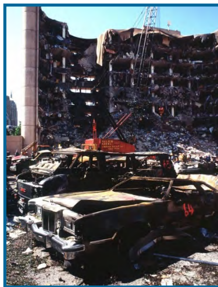
Figure 5: The Alfred P. Murrah Building following the 1995 bombing in Oklahoma City that killed 168 people and injured more than 500.